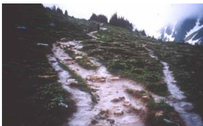
Trail braiding in Cavell Meadows

In order to be successful at Cavell Meadows we need support from people like you. We invite you to make your footsteps count by making a contribution to the Cavell Meadows Restoration Project.