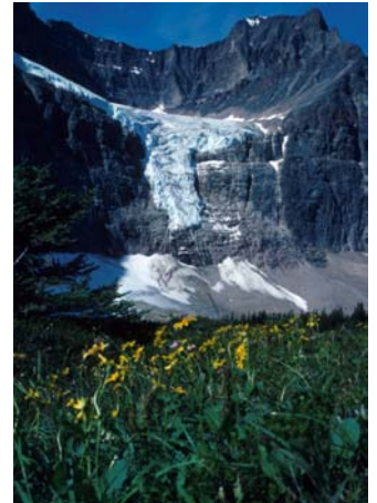
The spectacular view from Cavell Meadows attracts thousands of visitors each year.